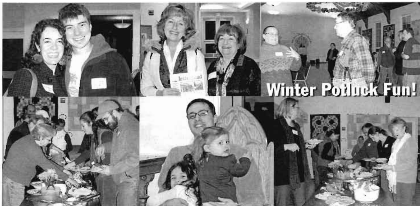
Winter Potluck Fun!

On a cold, snow stormy night, the Lettered Street neighbors gathered at the First Congregational Church. An excited hum of conversations circled around the dining room. The harmonizing Honeybees entertained a full room. Buffet tables held dozens of delectable dishes. Church board members and a Pastor joined in on the fun.